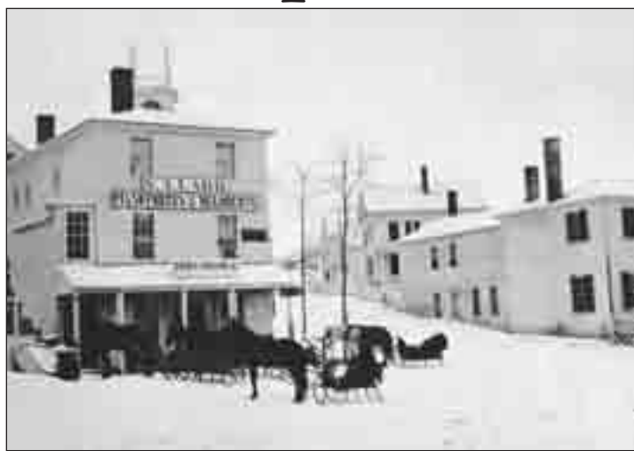
The building that housed the original Meredith Village Savings Bank in Meredith, circa 1869. The Bank is inviting the community to celebrate its 140th anniversary with a series of open house events throughout the Lakes Region. The next event is scheduled for Friday, July 31, 1-3 p.m. at the Bank's Main Office on Route 25 in Meredith.

When continued growth made it apparent that larger quarters would be needed for both the Bank and its associate, the Meredith Trust Company, plans took shape for a new building on the Charles and Cote lots on Winnepesaukee Street (now known as Route 25). In May 1958, the Bank moved into the new space, where it continues to do business today. In addition to offering full-service banking, the Main Office houses the Bank's senior leadership team and several of its administrative offices, including the Human Resources Department. MVSB also operates a second full-service branch in Meredith at the Olde